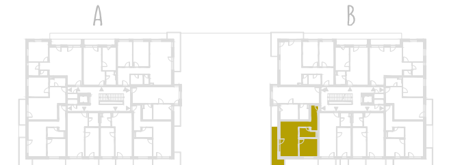
SCHEMA PŮDORYSU 7. NP / SCHEME OF THE SEVENTH FLOOR