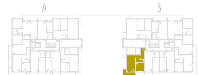
SCHEMA PŮDORYSU 3. NP / SCHEME OF THE THIRD FLOOR

PŮDORYS JE SPRACOVANÝ NA MARKETINGOVÉ ÚČELY / ZARIADOVACIE PREDMETY A ICH ROZMIESTNENIE MÁ LEN ILUSTRÁČNÝ CHARAKTER FLOOR PLAN IS PROCESSED FOR MARKETING PURPOSES / FURNITURE AND ITS PLACEMENT IS ONLY FOR ILLUSTRATION