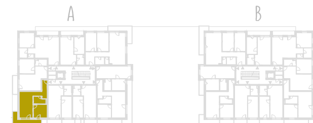
SCHEMA PŮDORYSU 4. NP / SCHEME OF THE FOURTH FLOOR

PŮDORYS JE SPRACOVANÝ NA MARKETINGOVÉ ÚČELY / ZARIADOVACIE PREDMETY A ICH ROZMIESTNENIE MÁ LEN ILLUSTRACNÝ CHARAKTER FLOOR PLAN IS PROCESSED FOR MARKETING PURPOSES / FURNITURE AND ITS PLACEMENT IS ONLY FOR ILLUSTRATION