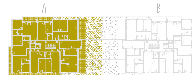
SCHEMA PŮDORYSU 2. NP / SCHEME OF THE SECOND FLOOR